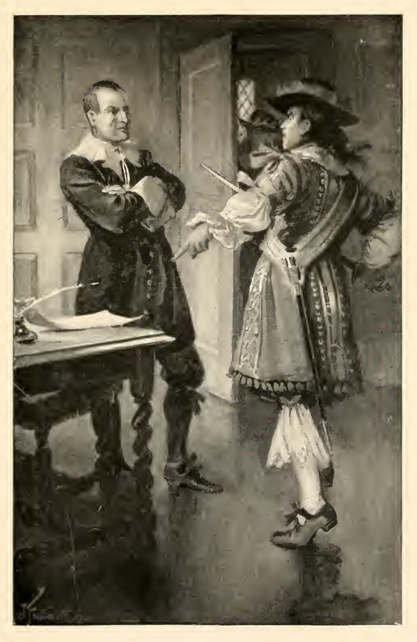
" FOR THE LAST TIME: WILL YOU SIGN THE DEED?"