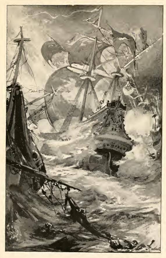
"A DUTCH MAN-OF-WAR RAN ALONGSIDE AND FIRED A BROADSIDE."