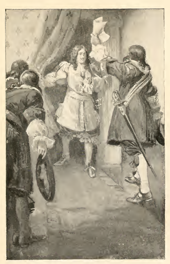
"WHAT NEWS. JAMES?" THE KING ASKED EAGERLY.