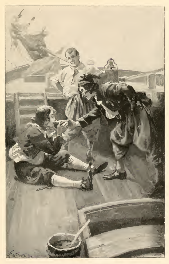
"CYRIL SAT UP AND DRANK OFF THE CONTENTS OF THE PANNIKIN,"