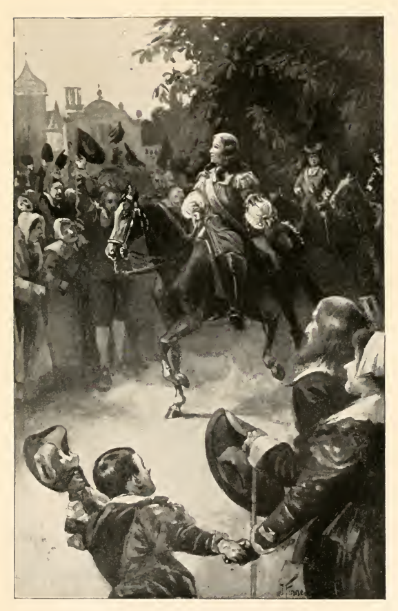
"WELCOME BACK TO YOUR OWN AGAIN, SIR CYRIL!"