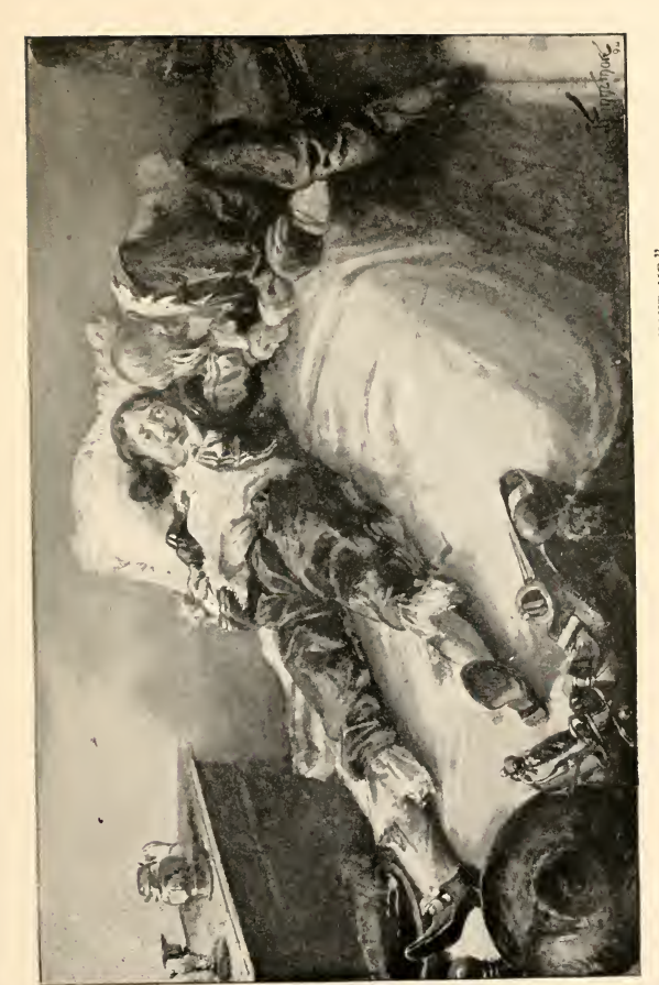
"DON'T CRY, LAD; YOU WILL GET ON BETTER WITHOUT ME."