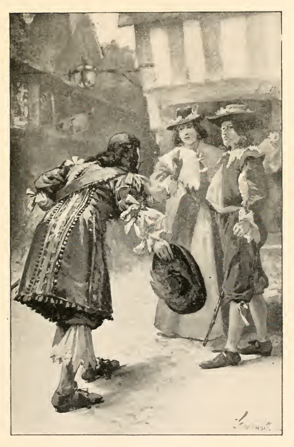
"FOR HEAVEN'S SAKE, SIR, DO NOT CAUSE TROUBLE."