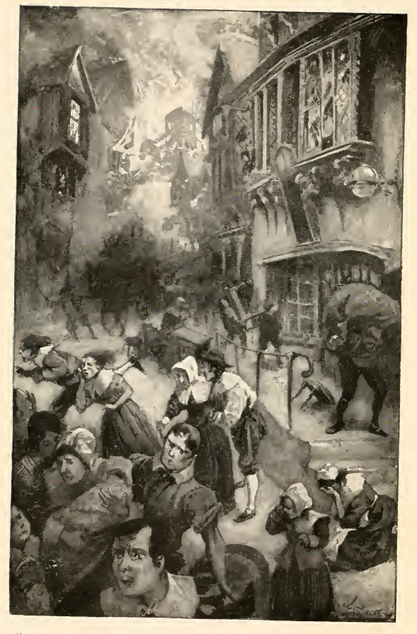
"WITH GREAT RAPIDITY THE FLAMES SPREAD FROM HOUSE TO HOUSE,"